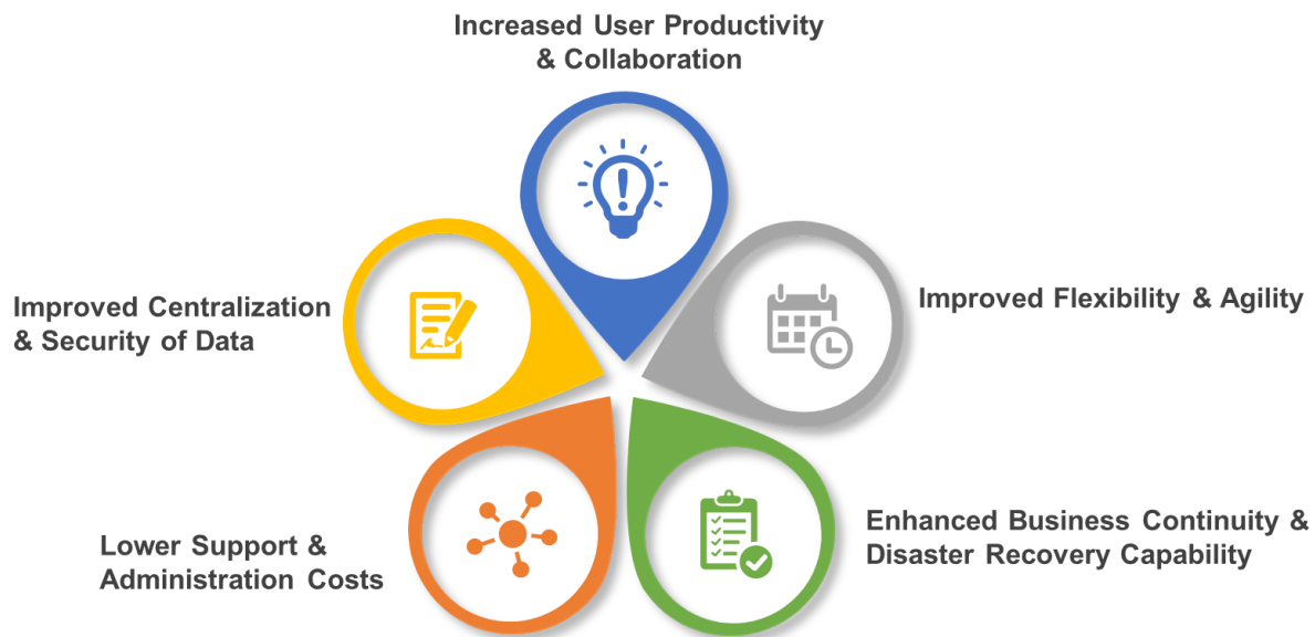
FIGURE 2: Promise of Desktop Virtualization

To account for diverse sets of expectations, companies are increasingly turning to desktop virtualization as the panacea to such problems. The benefits to the employees and the IT departments of companies are numerous and are represented in Figure 2.